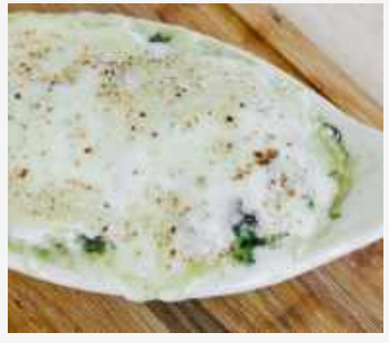
$55 PER PERSON